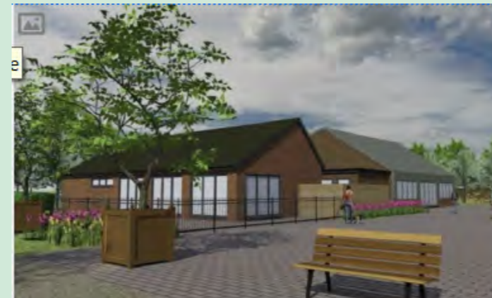
We're raising £100,000 to complete Roman Park Hall at Berryfields

News of the opening date will follow in due course. In the meantime, we need to finish the interior of the hall with furnishings and other equipment. Please see the advert below for details of how you can help.